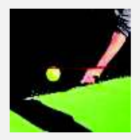
Figure 4-2 (illegal serve)