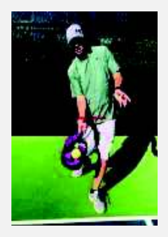
Figure 4-1 (legal serve)