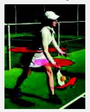
Figure 4-3 (legal serve)

(Photos and graphics courtesy of Steve Taylor, Digital Spatula)